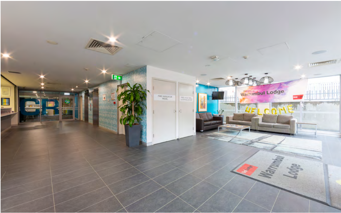
Warrumbul Lodge foyer

The shower drain is clogged: This is a common issue and usually occurs when there is a build-up over time of hair, bathing products, dirt, etc. If the shower drain is clogged, you may notice it will take longer than usual for water to drain completely. In rare cases, this may result in flooding the room. Do not attempt to unscrew the shower drain and remove the blockage yourself as this can loosen the shower trap and result in water leaking into the carpet and adjacent rooms. Visit or call reception immediately, as soon as you notice a clogged drain.