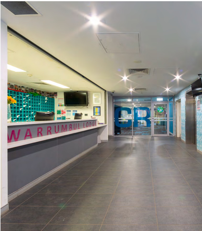
Welcome to Warrumbul Lodge

Flashing red/green light after tapping your key card: A red/green flashing light means your door lock is running low on batteries. You will still be able to access your room. Listen for a click a second after you tap your key card, then push the handle down. Please notify reception at your earliest convenience, so the batteries can be replaced.