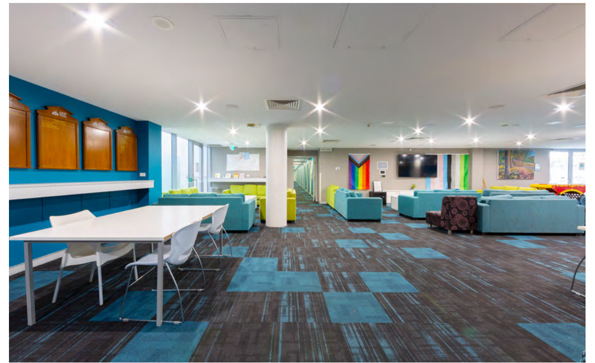
Warrumbul Lodge common room

If the phone displays Discover 130.56.xxx.xx on the main screen it will need to be reset. To reset, click the left, grey button under the main screen. If problems persist, please connect with reception to submit a maintenance request.