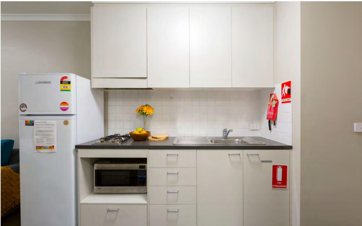
Kitchenette in studio long

Smoke in the room: Smoke in the room may trigger the fire alarm. If the fire alarm in your room goes off please remain calm, open all the windows and ensure the rangehood is running. Do not open the main door as it can trigger the building alarm and will incur a significant fine –$880 in 2025 (see the ANU Residential Schedule of Fees ). Light is not working: If the rangehood light stops working, it does not usually affect the functionality of the rangehood itself. If the rangehood stops working altogether, please submit a maintenance request with reception.