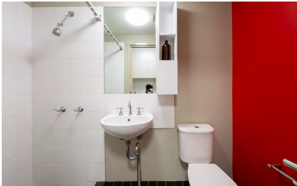
Bathroom in studio long