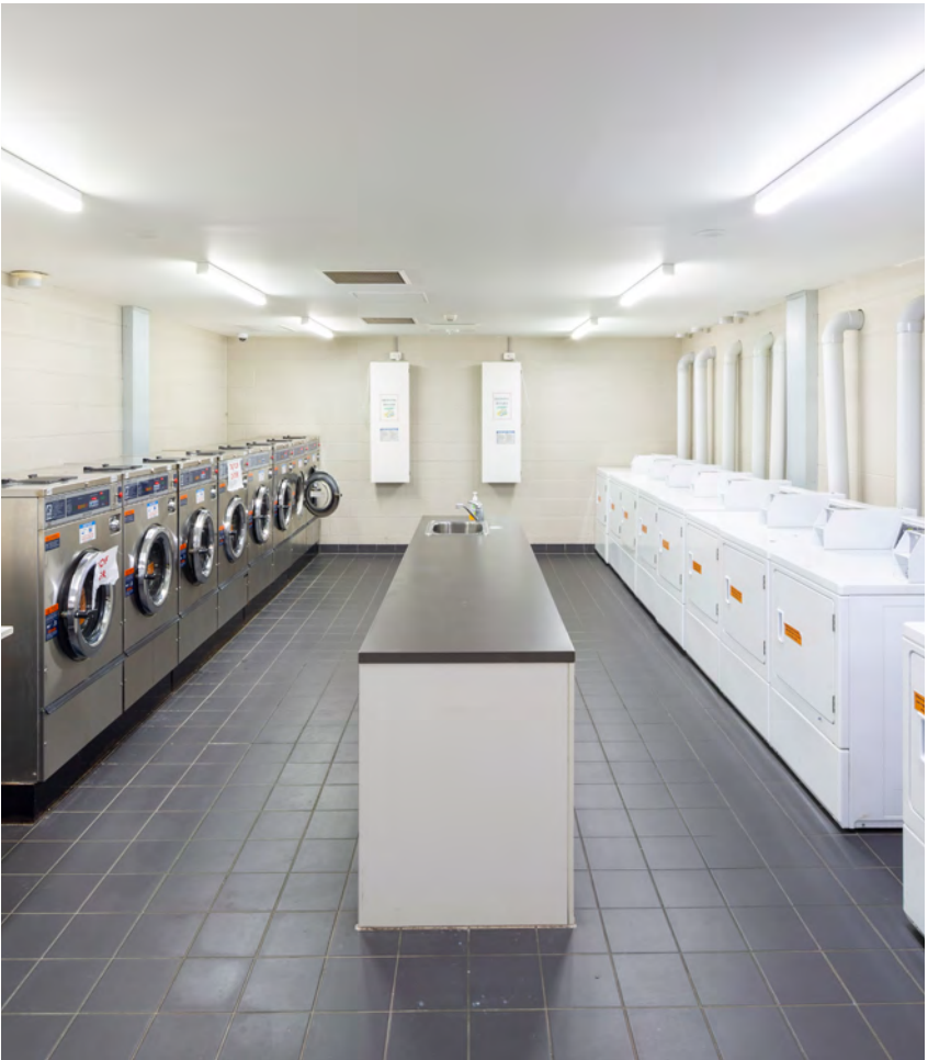
Davey Lodge laundry

All the bathrooms at Davey Lodge are installed with the dual-flush toilet, with half-flush and full-flush options. Dual-flush toilets save around 67 percent of water used compared to regular toilets.