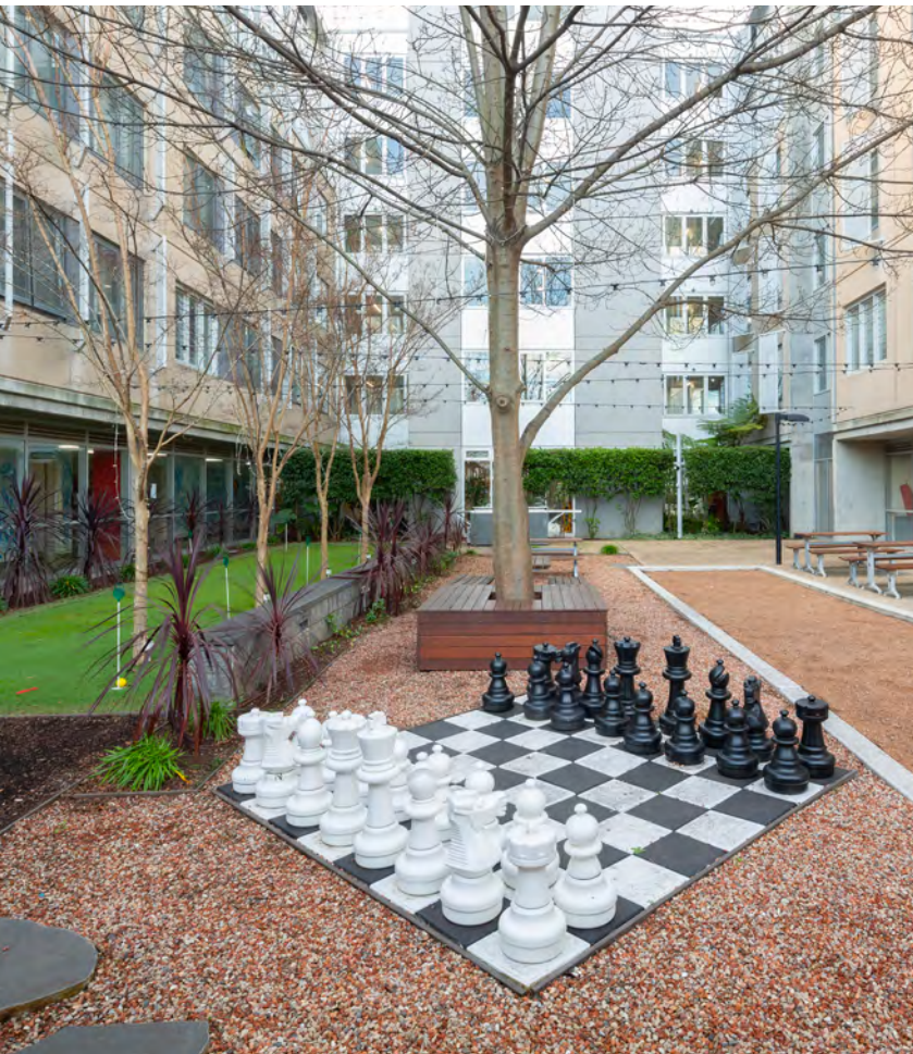
Davey Lodge courtyard

Flashing red/green light after tapping your key card: A red/green flashing light means your door lock is running low on batteries. You will still be able to access your room. Listen for a click a second after you tap your key card, then push the handle down. Please notify reception at your earliest convenience, so the batteries can be replaced.