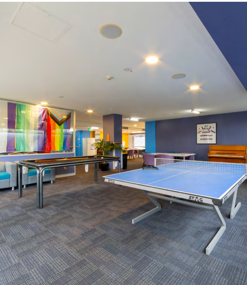
Davey Lodge games room

If an urgent maintenance issue occurs after hours, contact the Community Support Officer on duty immediately.