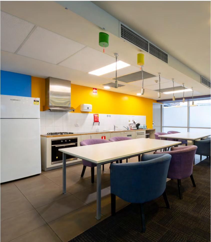
Davey Lodge common room

Low water pressure: While this is not a common issue, various causes, such as leaks, faulty taps, or blocked pipes may contribute to low water pressure. If you experience issues with low water pressure in the sink or shower taps, please submit a maintenance request with reception.