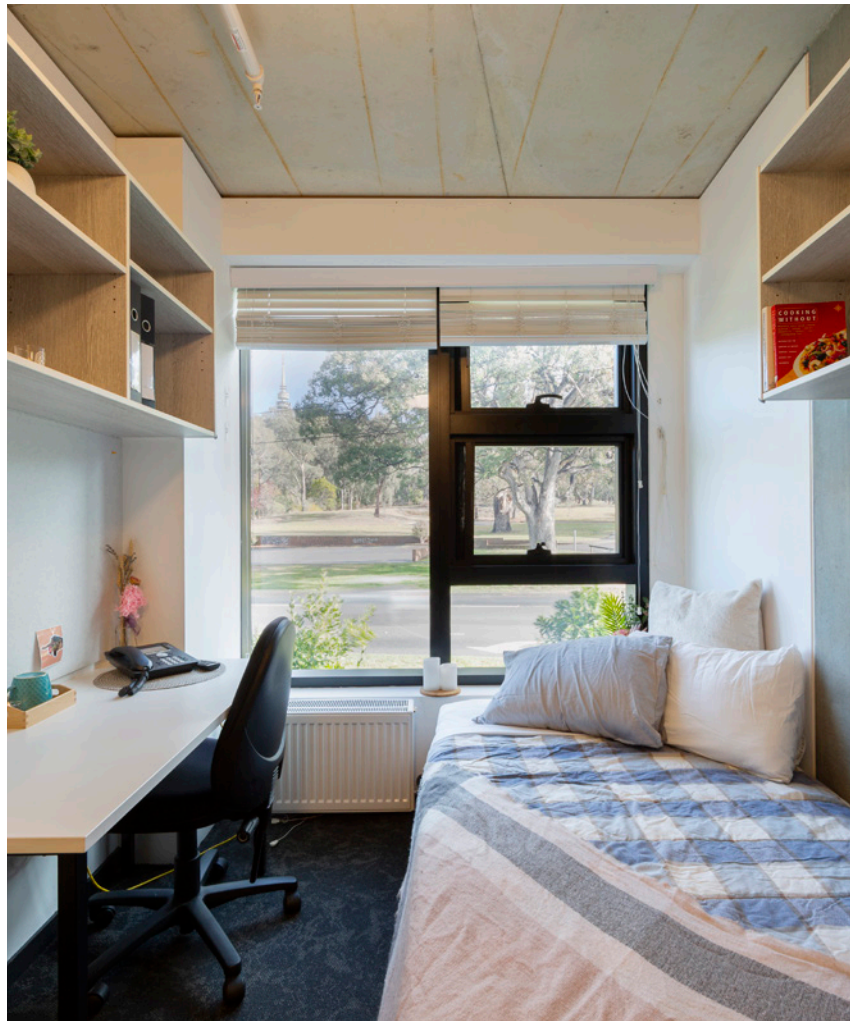
Wamburun Hall corner room

If you are still experiencing trouble, please submit a maintenance request by calling or emailing reception.