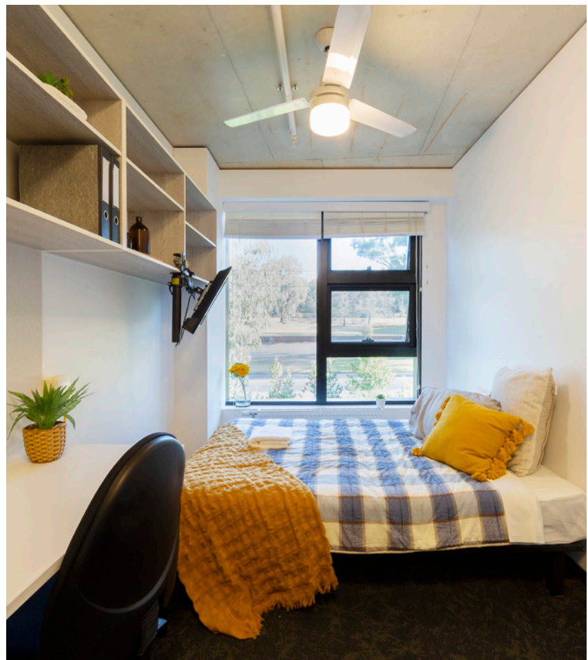
Wamburun Hall standard room

If this does not fix the issue, log a ticket with the IT service desk .