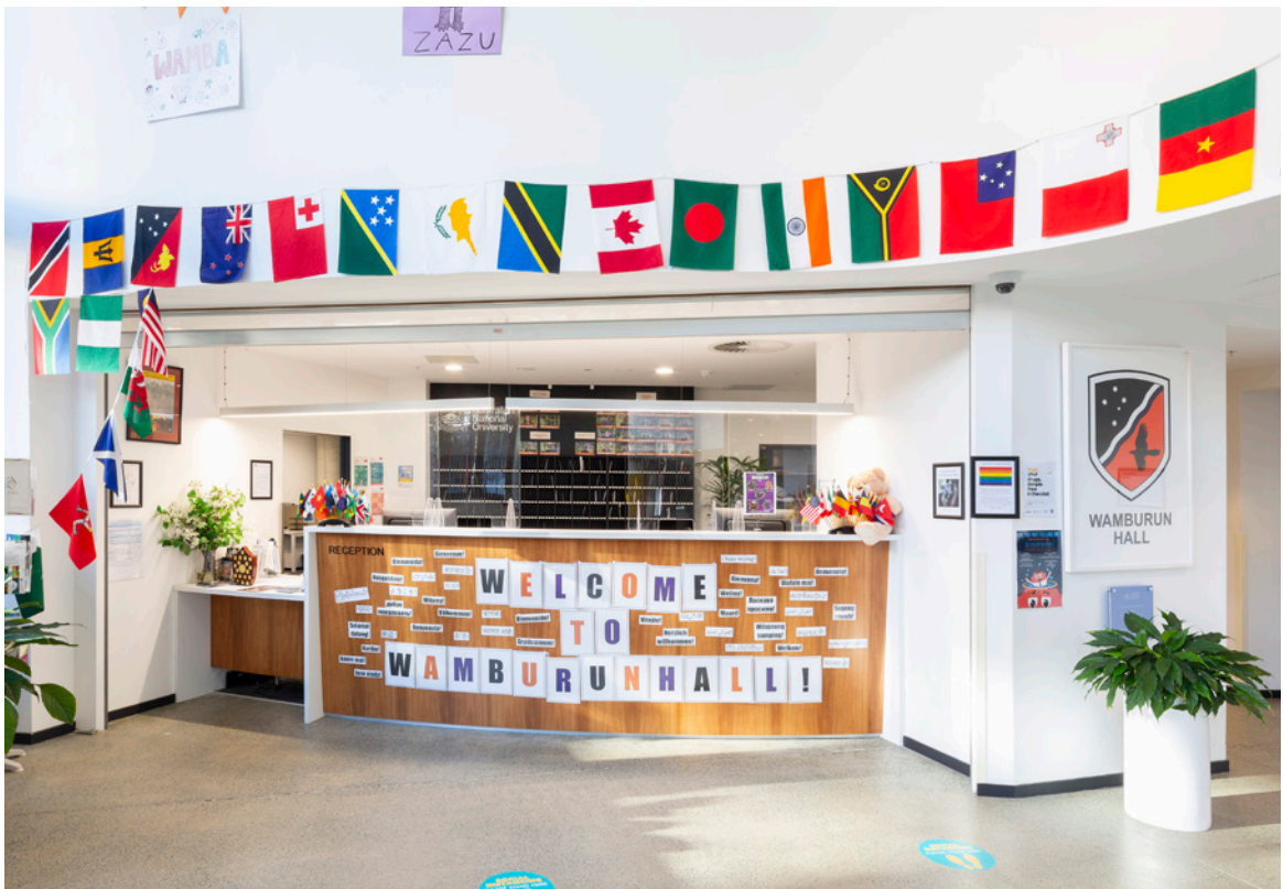
Wamburun Hall foyer