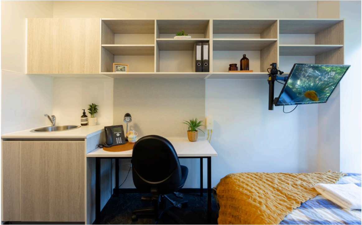
Sink, phone and TV monitor in standard room