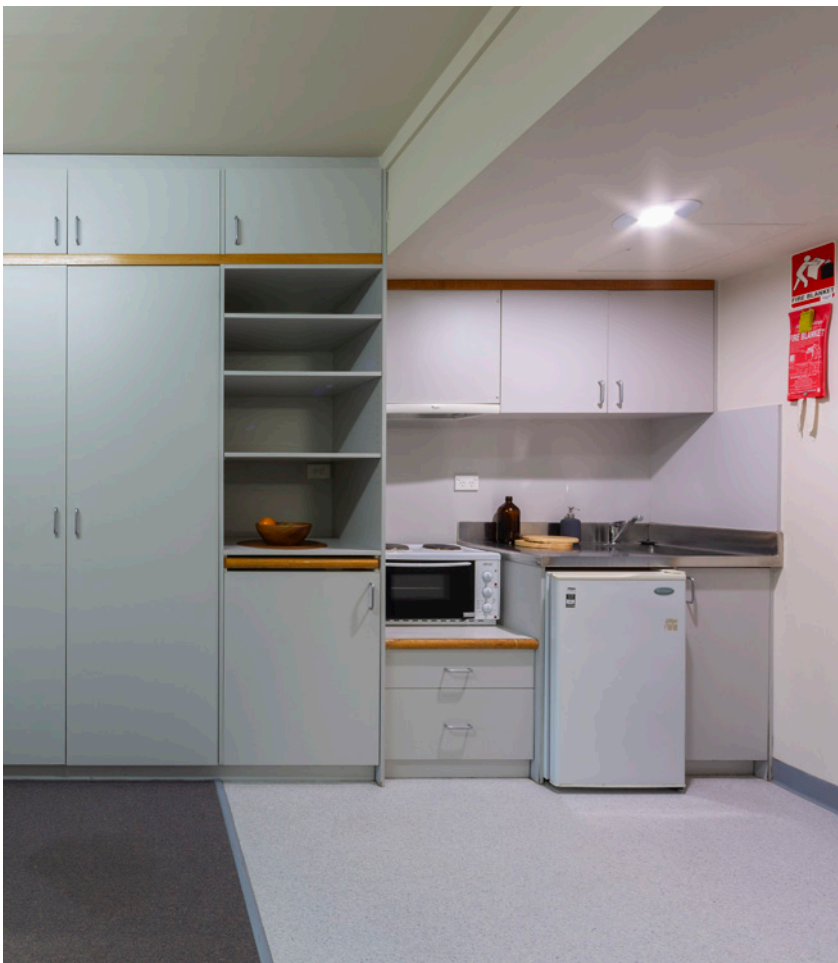
Kitchenette in standard room

Room phones are not to be used to cause nuisance or annoyance to other residents, staff or students of the University, or any other people. Any resident who receives nuisance or offensive phone calls should immediately advise the Residence Manager. Abusing a person's privacy in this way will not be tolerated and offenders may face disciplinary action.