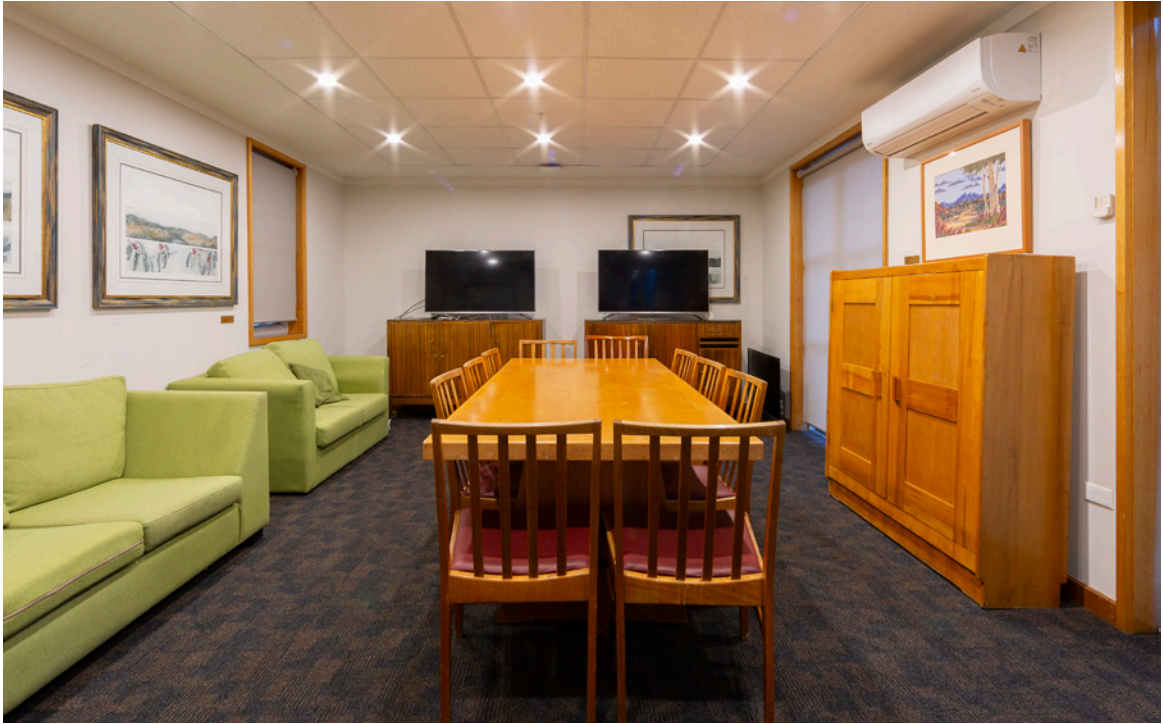
Graduate House conference room