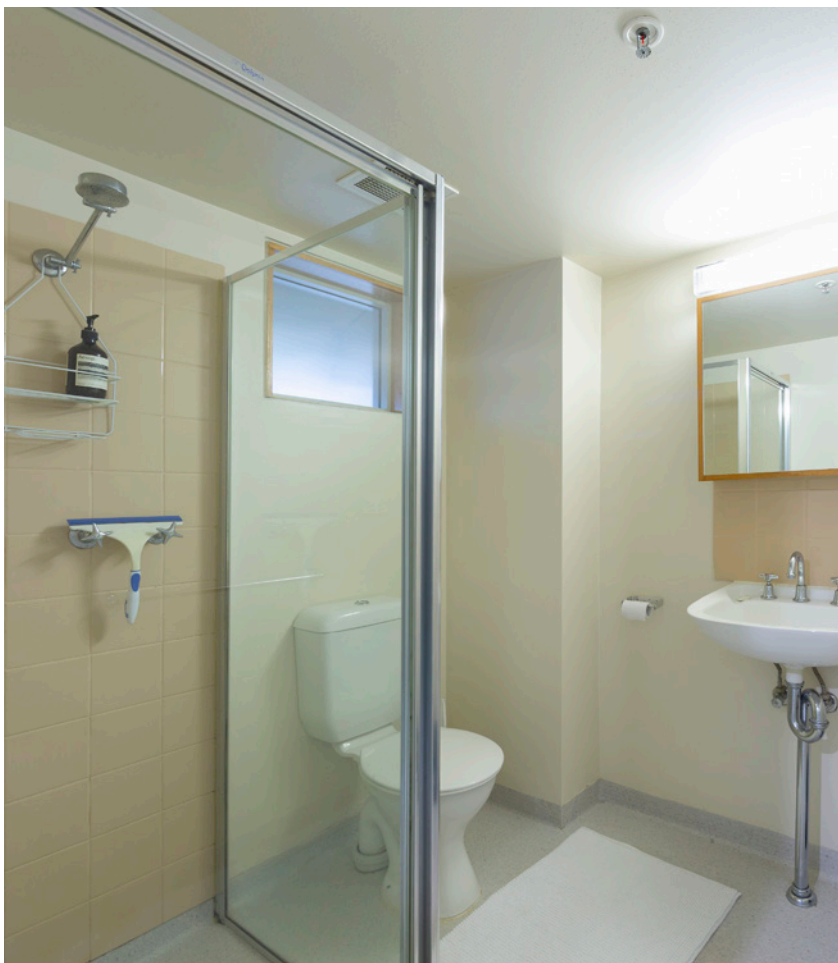
Bathroom in standard room

Residents who use the kitchen are responsible for maintaining its cleanliness, including sinks, floor, benches, cupboards and fridge/freezer. Essentially, this means removing any food that could or has already deteriorated to prevent contamination of other food, wiping down benches, and cleaning up after yourself.