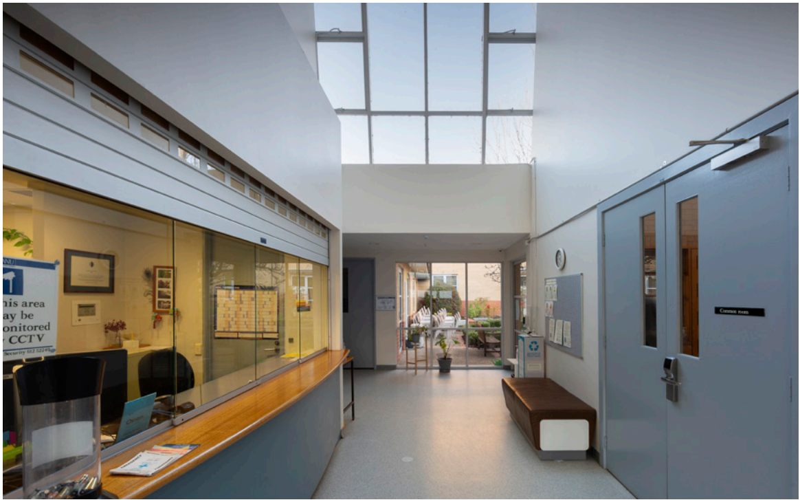
Graduate House reception