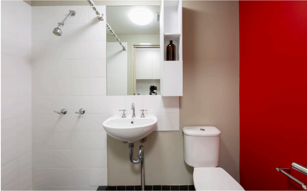
Bathroom in studio long