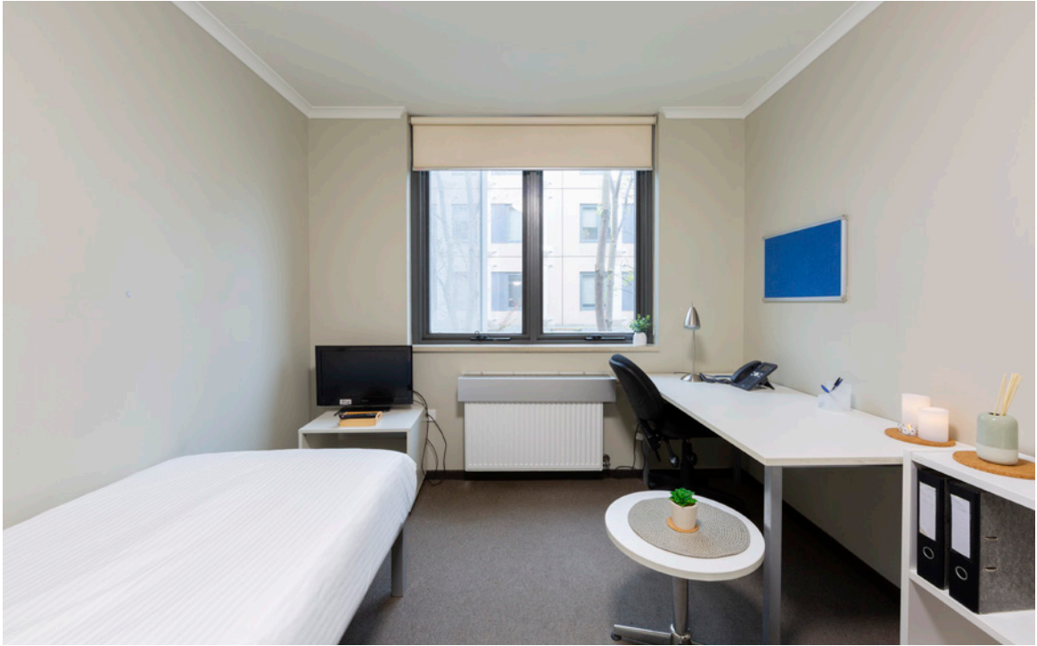
Room heater, landline phone, TV monitor