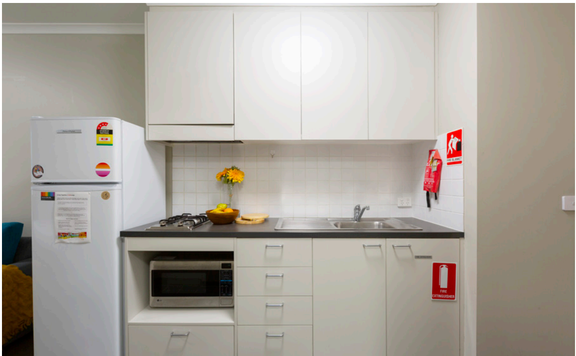
Kitchenette in studio long

Light is not working: If the rangehood light stops working, it does not usually affect the functionality of the rangehood itself. If the rangehood stops working altogether, please submit a maintenance request with reception.