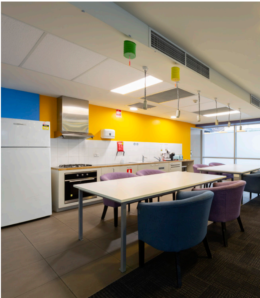
Davey Lodge common room

Low water pressure: While this is not a common issue, various causes, such as leaks, faulty taps, or blocked pipes may contribute to low water pressure. If you experience issues with low water pressure in the sink or shower taps, please submit a maintenance request with reception.