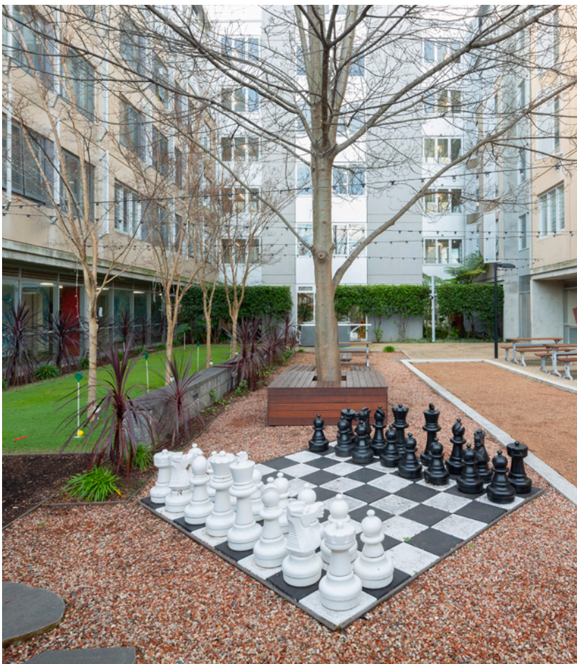
Davey Lodge courtyard

Flashing red/green light after tapping your key card: A red/green flashing light means your door lock is running low on batteries. You will still be able to access your room. Listen for a click a second after you tap your key card, then push the handle down. Please notify reception at your earliest convenience, so the batteries can be replaced.