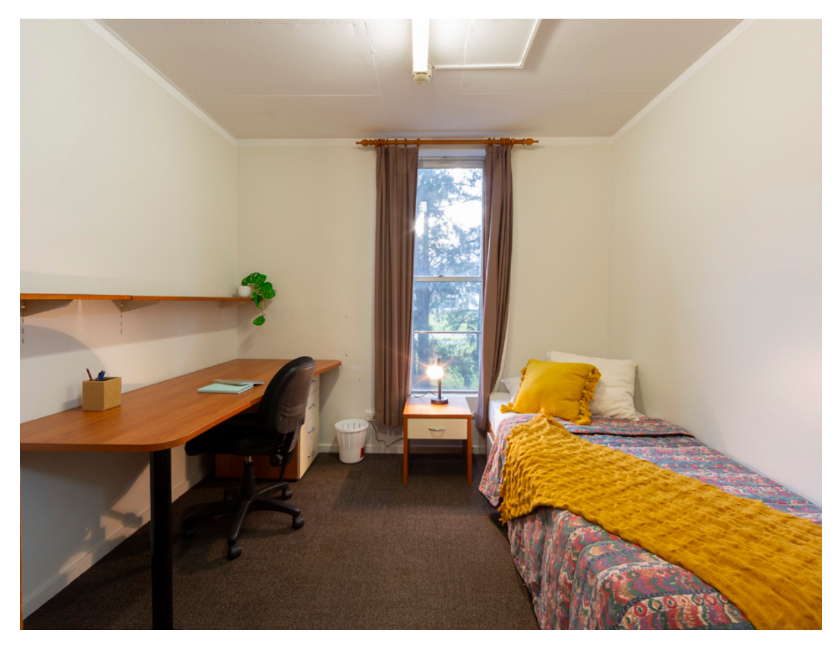
Burton and Garran Hall standard room